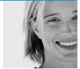
Dental Plan of Choice

Want to know the status of a claim? Need to find a dentist closer to you? You can do all of this and more at www.mycompbenefits.com . Registering for this service is simple and will give you access to your plan benefits, including your benefit information, claims status, a list of providers and the option to change your account information. Just a few clicks of the mouse, and you'll be checking out your benefits in no time.