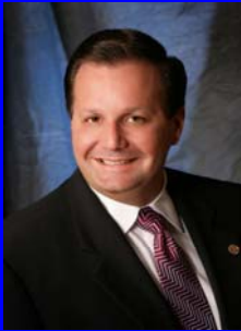
Mayor Julio Robaina

305-883-5800 501 Palm Avenue Hialeah, FL 33010