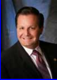
Mayor Julio Robaina

305-883-5800 501 Palm Avenue Hialeah, FL 33010