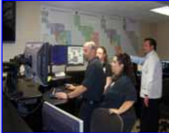
April 16, 2010

Immaculate Concep- tion Catholic School Government Class Visits City Hall