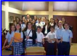
April 30, 2010

Immaculate Concep- tion Catholic School Government Class Visits City Hall